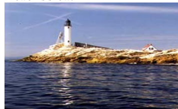
A lighthouse in the Isles of Shoals

I just moved from New Hampshire, and I miss it. Some facts about New Hampshire are that New Hampshire was one of the first 13 states. New Hampshire is the first states to vote in the Presidential Election, which meant my Mom could vote early. Boston and the Isles of Shoals were once part of New Hampshire. I took a boat to the Isles of Shoals. It was a long ride during the night. There was a cool fireworks show.