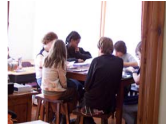
Students discuss their latest literature selection in Book Club.

Book Club is a great time for students to share their thoughts on the books they read. Another fun part of Book Club is the news! Yes, the students watch a special CNN news program geared for kids. This is a fun way to find out about what is happening in the world.