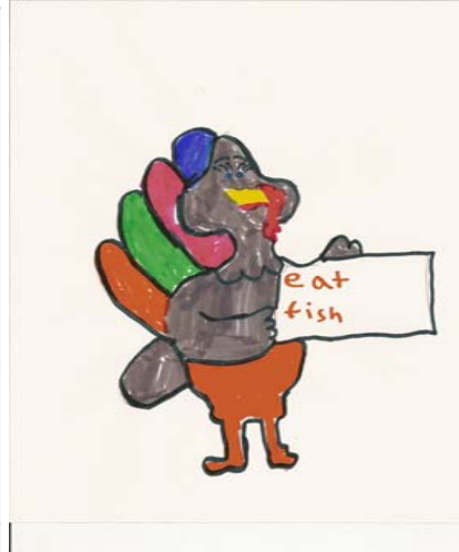
Corey Age 7