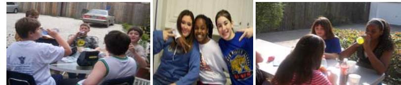
Enjoying the great weather with friends!