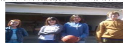
Teaming up for a group photo!