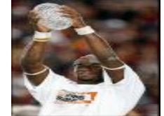
Vince Young holds up his MVP Crystal Football

Texas is no longer second to Southern California. I guess it’s true you “Don’t Mess With Texas!”