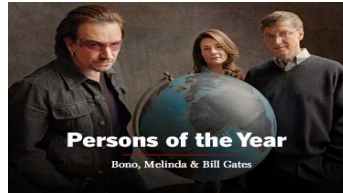
Bono with fellow recipients Bill & Melinda Gates

U2 front man Bono has been named one of Time Magazines Persons of the Year. Bono, whose real name is Paul, shares the prestigious position with Microsoft Chief Bill Gates and his wife Melinda, all for their charitable efforts. Bono convinced Industrial nations to forgive 40 billion dollars in debts incurred by developing countries. The magazine states that Bono is charming and witty. Among those singing Bono’s praises is retired US Senator Jesse Helms, a conservative who developed a friendship with Bono because he is “genuine.” Bono proves that with great fortune comes great responsibility and giving back really rocks!