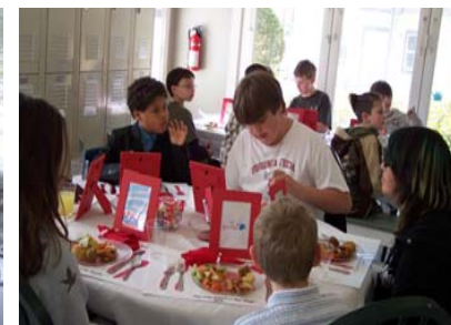
Students enjoy a special lunch and some new friendships.