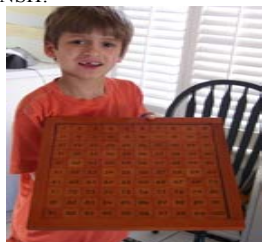
Campbell completes the 100 board!

The day was full of 100 th day fun. The students made a 100 th day snack by counting out ten pieces of snack foods from 10 snacks to make 100! Then they watched 101 Dalmatians and as a special treat that had pizza! That was a big surprise! It was a happy 100 th Day of School at NSH!