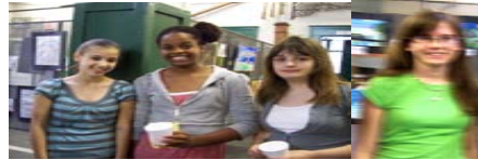
The girls gather at the Art Show.